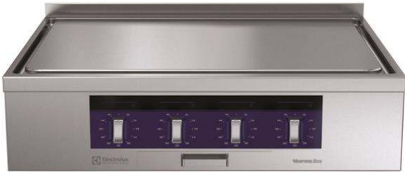
589131 (MCTCABJOAO) Electric Free-Cooking Top, one-side operated with backplash